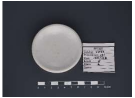
3 A typical undecorated stoneware butter pat

Butter pats were used in Victorian times during formal dinners where bread was served to each guest and placed on the tablecloth to the left of the place setting. The butter pat, also placed on the left of the place setting, held one or two slices, or molded portions, of butter. Butter pats went out of use by the early 1900's, as bread plates became the standard for semi-formal dining events. Given that I recorded 99 whole and partial pieces made from numerous potteries in the United States, England and Japan, and exhibiting more than 10 different patterns, I was confused why this hotel, admittedly not a first-class establishment, possessed so many butter pats.