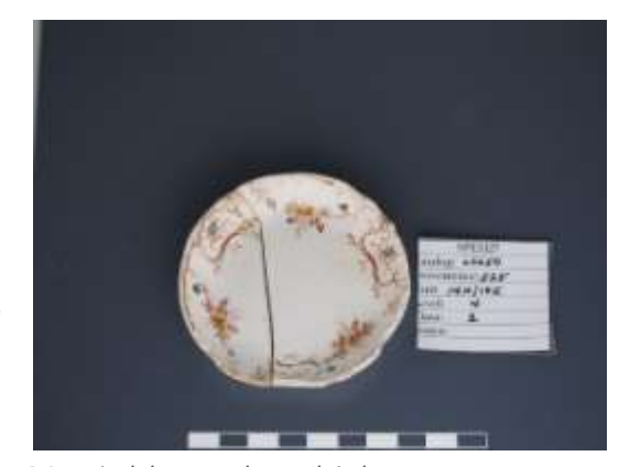
4 A typical decorated porcelain butter pat

Later editions of the Sears and Montgomery Ward catalogs continued to offer the butter pats with their porcelain china. Butter pats were no longer offered with lesser quality dinnerware. By the Sears catalog of 1907, butter pats had fallen out of fashion and no longer available for purchase.