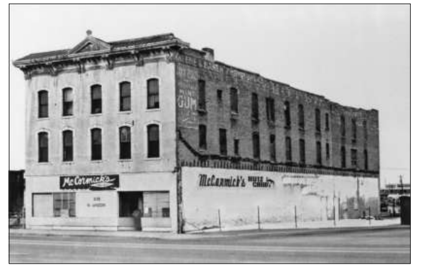
2The Farris Hotel in 1989

Dr. Buckles began excavations in the basement of the hotel in 1989, and as might be expected after the hotel was torn down, he encountered a vast quantity of construction debris and hotel-related artifacts. The vast majority of the 20,000 artifacts collected relate to the hotel and the associated commercial area.